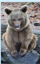
What's My Name?