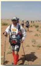
Supporting SOTE II

The second element of compassion is our long-term partnerships with sport and health organizations. Our sponsorship of clubs (like the Buda Juniors) that foster healthy life-long habits in children and young adults is just one of the ways FirstMed gives back to the community and helps to ensure a better future for all.