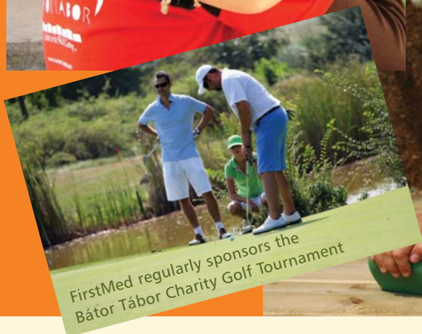
FirstMed regularly sponsors the Bátor Tátor Charity Golf Tournament